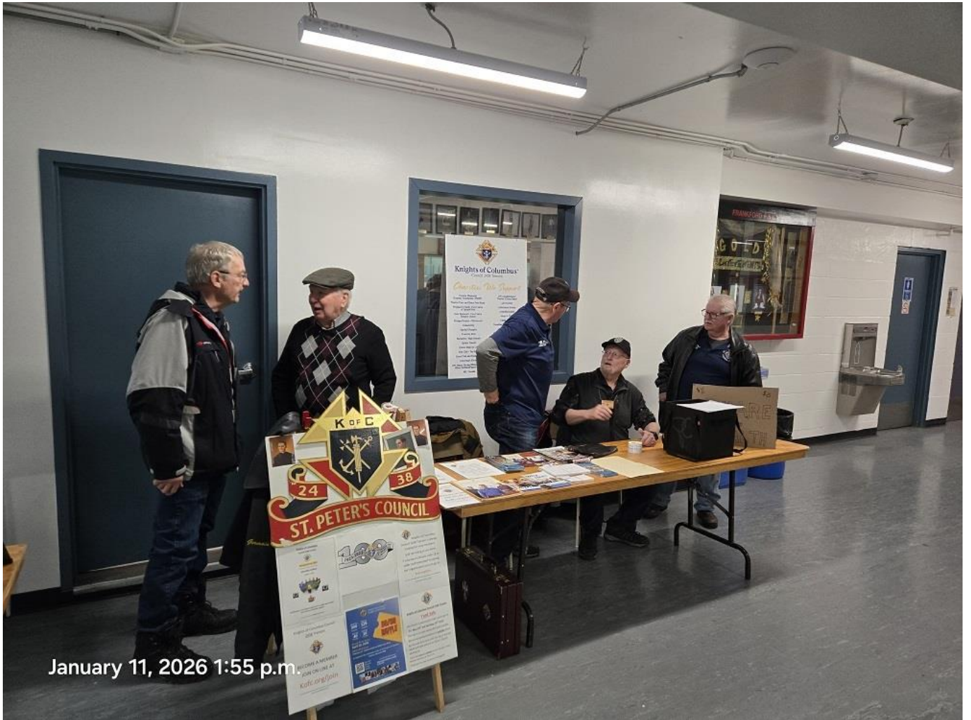
January 11, 2026 1:55 p.m.